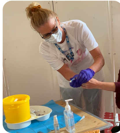
This picture shows a finger prick test being taken. There are other ways of testing available.

Had a chance of your mother having hepatitis C during childbirth?